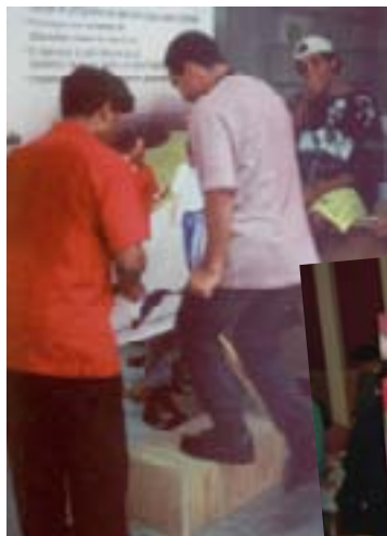
Exercise — The Harvard step-test lets you find out the level of your physical fitness. Three minutes of exercise reveal whether the heart of a person is sufficiently trained. All you need is a simple wood step.