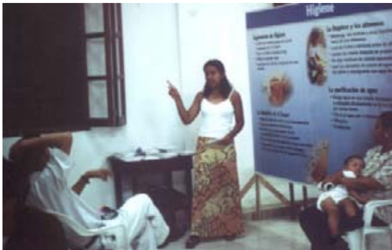
Water — Each booth provides a setting for teaching one of the principles of the eight laws of health.