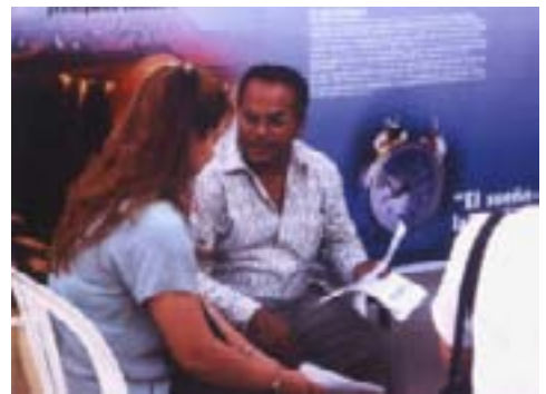
The Computer Health-Age Appraisal is a very popular tool telling the biological age of the body according to a lifestyle questionnaire. The printed results are the basis for personal counseling as to which lifestyle changes will add to length and quality of life.