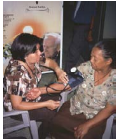
Sunshine. High blood pressure is mainly diet-related, but sunshine can also help to bring it down. Find out how people appreciate even a simple service like this.