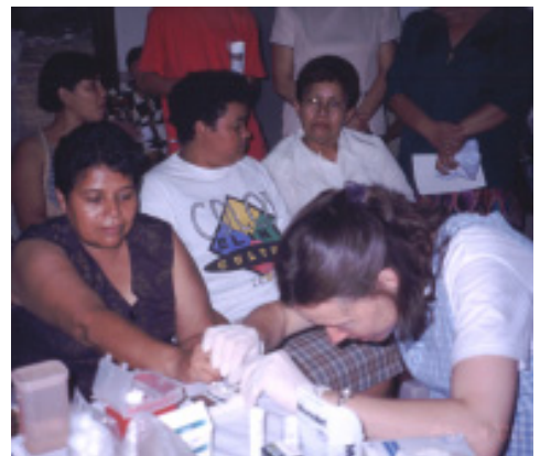
Nutrition — The glucose and cholesterol testing is always appreciated by the community. A successful tool to attract people to your expo location.